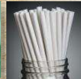
Paper based preform tests

Leveraging R&D partnerships with universities & start-ups