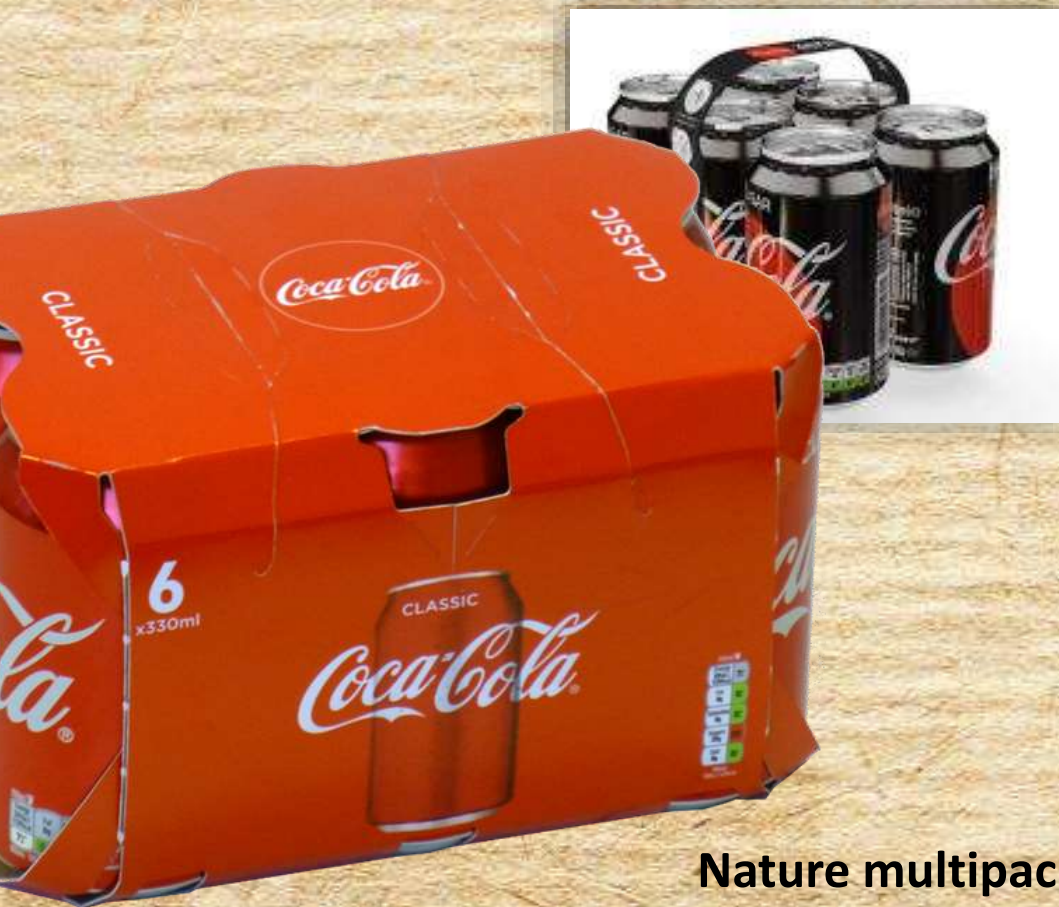
Nature multipack Paperback can-pack option